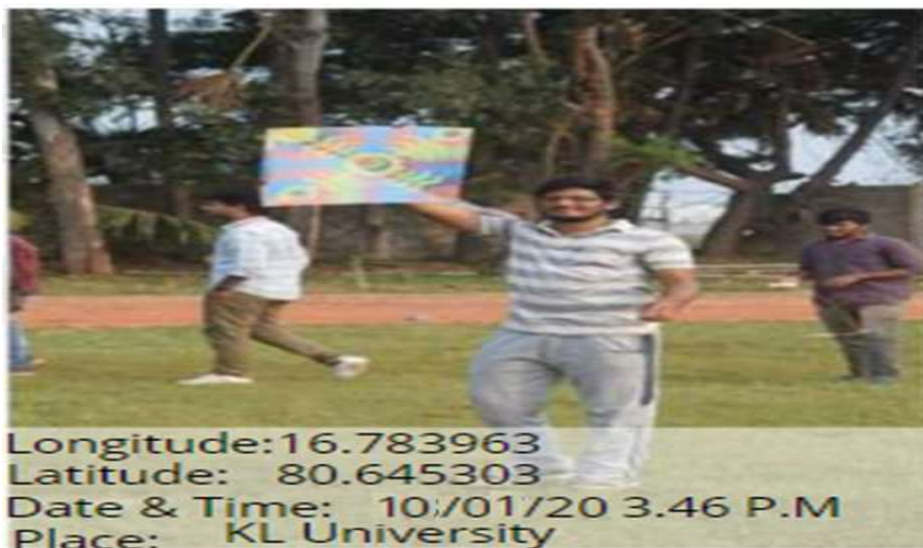
Flying kites by student on 10.01.2020